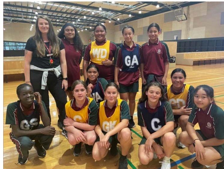
Year 7 Girls Netball 2021