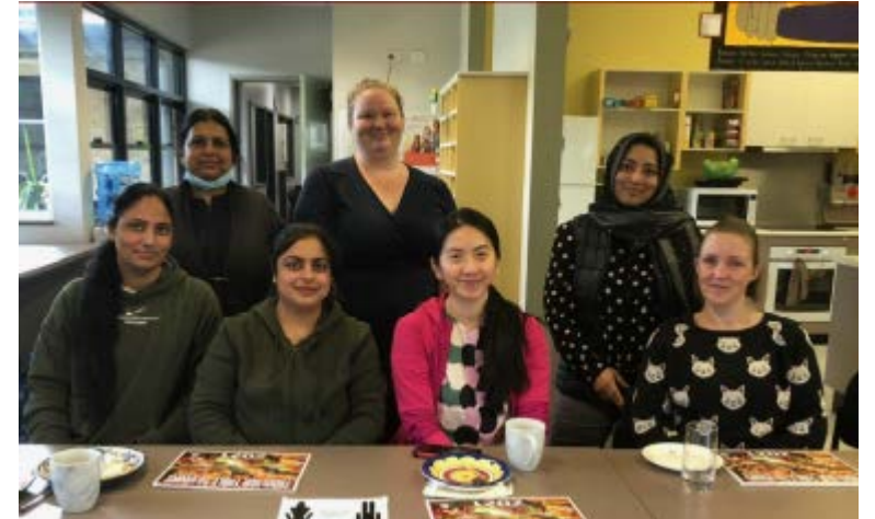
Parents and Friends meeting